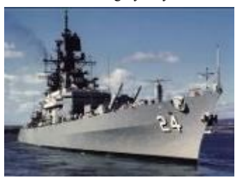
1975-Departing Pearl Harbor

Golf Shirts—all sizes T-Shirts -allsizes ($20) + s/h (2XL/3XL ($15) + s/h add $2) XL/3XL-add $2)